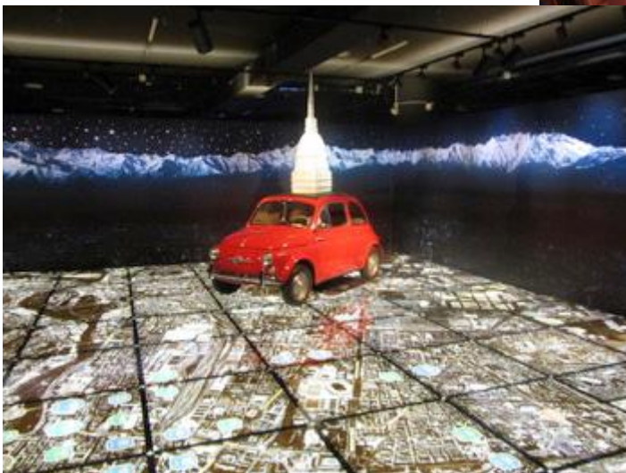
National Car Museum

The accompanying persons will have the opportunity to attend all the conference social events (welcome cocktail reception, social dinner, awards dinner) as well as enjoy two full-day tours to discover Turin's enchanting royal residences, baroque and liberty palaces and world-renown museums.