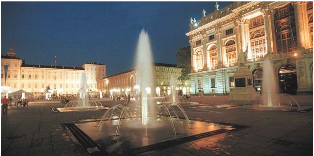
Piazza Castello by night

Motorways A6 Turin-Savona, A4 Turin-Milan-Venice, A21 Turin-Piacenza-Bologna, A5 Turin-Aosta, A32 Turin-Bardonecchia connect Turin to most Italian cities, to France, Switzerland, Austria and the rest of Europe