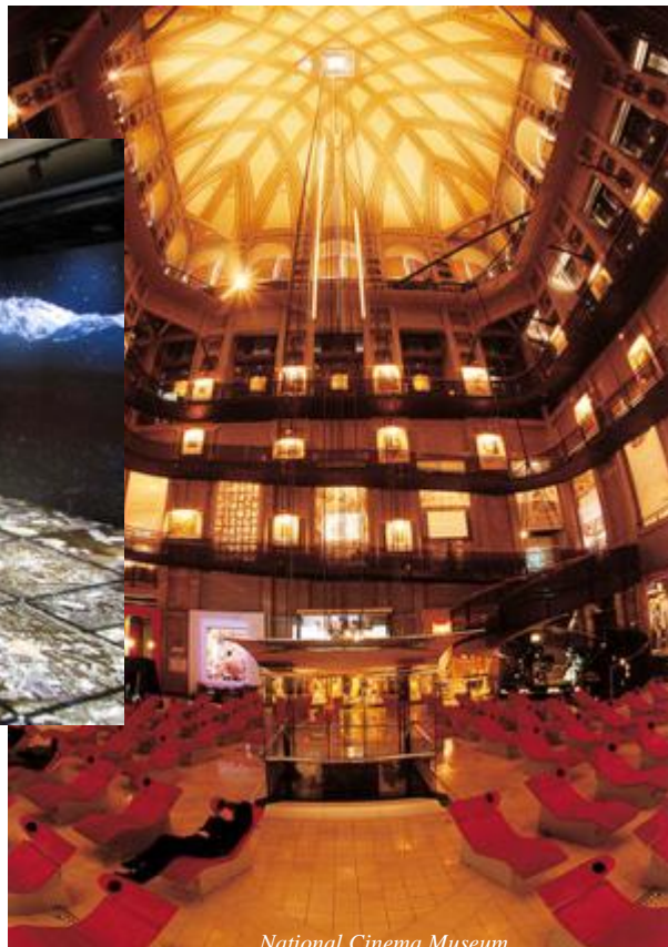
National Cinema Museum